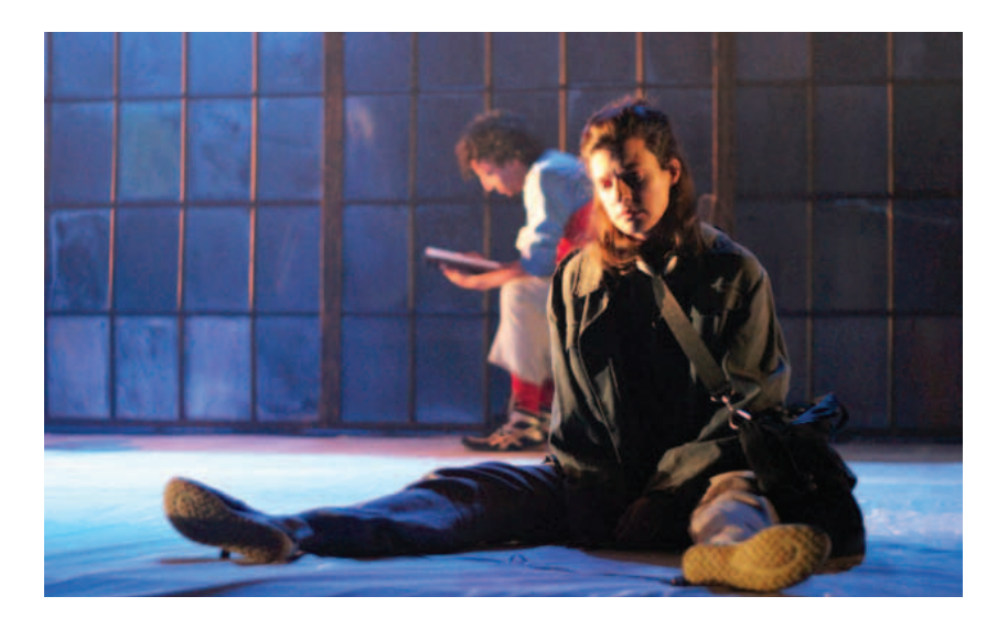
Picture 2: Actors perform in Wajdi Mouawad's play Incendies (Scorched) at Masrah Al-Madina during the Samir Kassir Foundation's May 2013 Beirut Spring Festival.